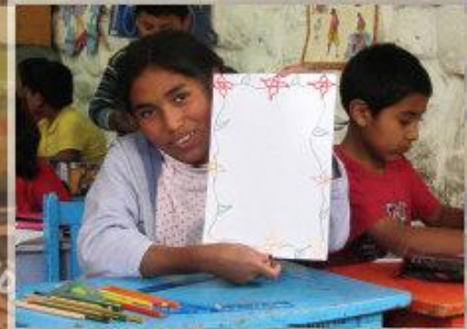
Huch'uy Runa - Cusco

"Huch'uy Runa" is dependent on donations and the sale of the products because the Peruvian government does not provide any financial support.