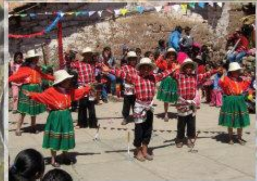
Huch'uy Runa - Cusco

Especially the small bakery, where up to 6 children learn the basics of baking bread and rolls, provides an important contribution through selling different kinds of bread, rolls and cookies.